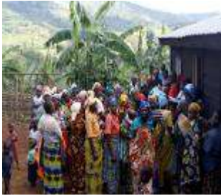
CEPAC beneficiaries from Rwabika

During the week long training workshop 27 participants mixed concrete learning with more relaxed working time to discuss and share ideas.