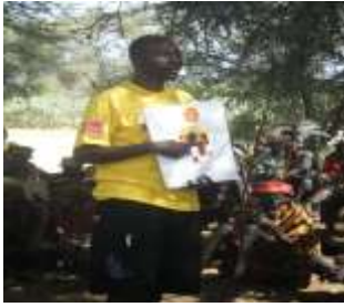
A HelpAge staff member explains the HSNP Service Charter at a community meeting.

and subsequent disempowerment and dependency.