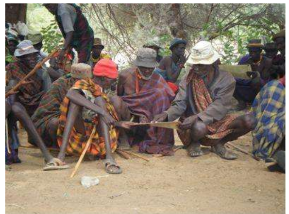
A group of illiterate older men scrutinise the pictorial version of the HSNP Service Charter during a community meeting.

To find out more about HelpAge International, please visit their website by clicking here .